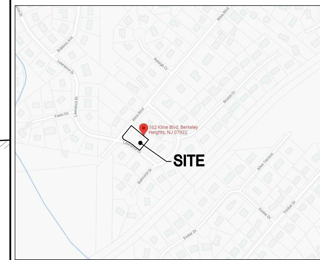
KEY MAP 1"=500'