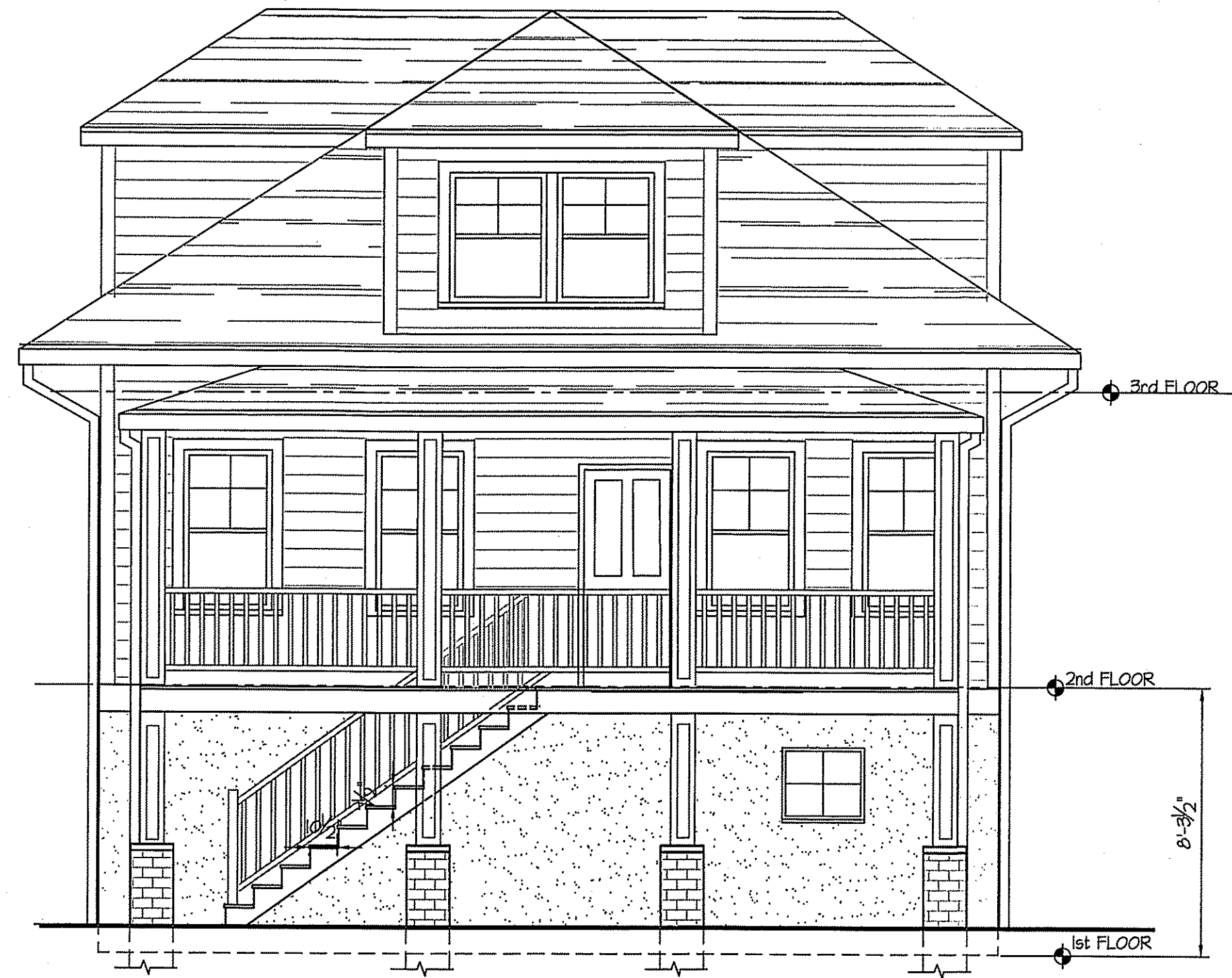
NORTH ELEVATION - EXISTING