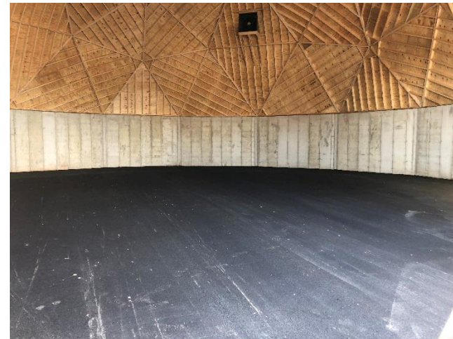
Salt dome interior after paving