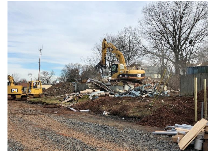
Demolition of former Recreation Center