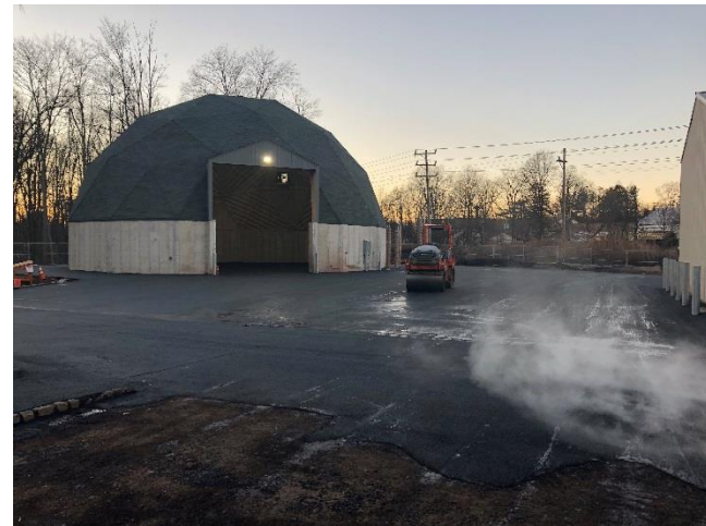
Rolling top layer of asphalt at salt dome