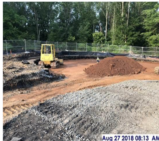
Backfilling at the New Salt Dome