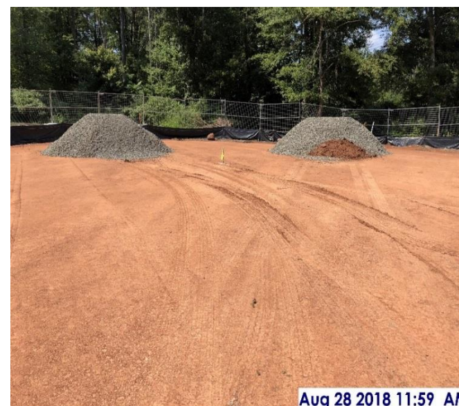
Stone for the base of the New Salt Dome