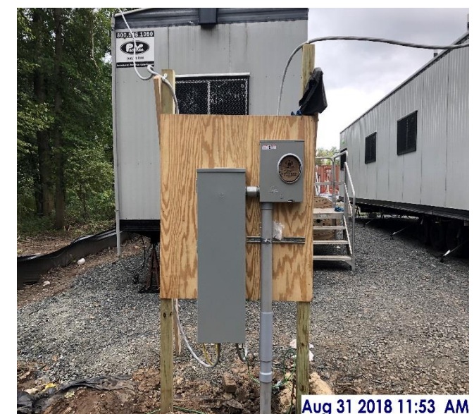
New electrical service panels at site trailers