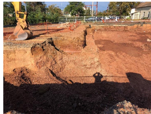
Excavation for new Municipal Building basement