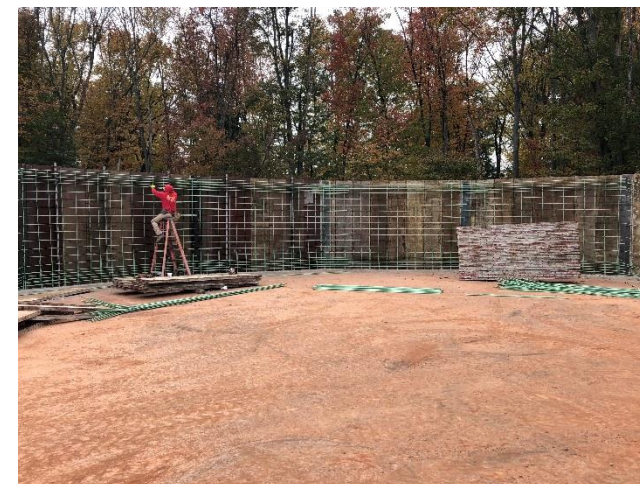
Rebar and form work for new salt dome walls