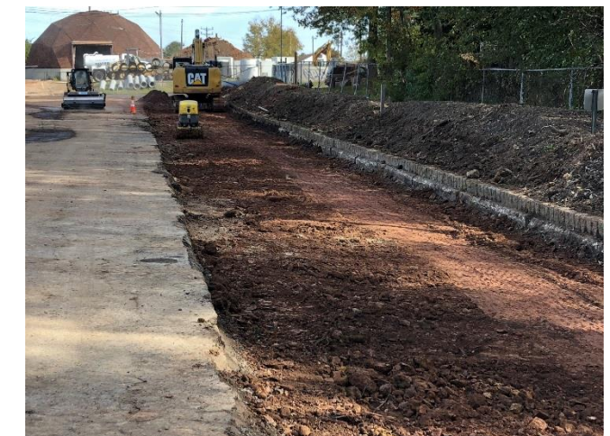
Backfill and compaction over new storm and water lines